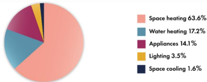
Figure 1. Distribution of residential energy use in Canada 2019, Natural Resources Canada

According to [1], Canadians allocate approximately 17% of their total energy consumption to water heating (Figure 1). This statistic underscores the significance of finding alternative solutions for heating water tanks, motivating homeowners to explore options like solar domestic hot water systems.